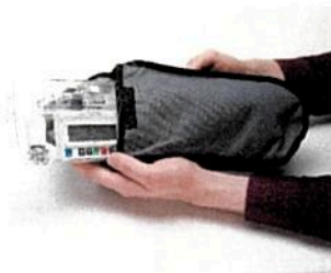
T34 Disposable Pouch